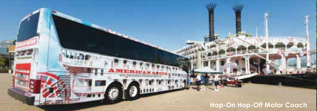
Hop-On Hop-Off Motor Coach